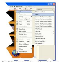
Figura 34: Crear transición de los botones de los menús de escenas

Ves que en cada recuadro, correspondiente a cada una de las escenas o capítulos, está puesto un número, de forma secuencial que va del 1 al 12. Pero también puedes observar que en los botones central y derecho se han puesto sendos números (13 y 14). Si pinchas sobre cada una de las escenas podrás ver que ya se ha fijado la relación o transición, de tal forma que pinchando en el primer recuadro nos indicará que irá a la escena o capítulo 1 de la película, el segundo a la segunda escena o capítulo de la película y así sucesivamente. Pero si pulsas en el botón central y derecho, verás que no existe relación o transición alguna. DVD-Lab PRO lo deja así para que seas tú quien establezca dichas relaciones y esto